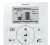
BRC1E52A wired controller

FCQG-F / RXS-L pairs are listed on the Energy Technology List (ETL) – the definitive list of products that qualify for Enhanced Capital Allowance (ECA).